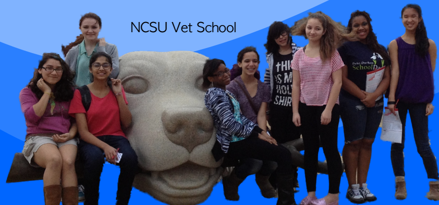
NCSU Vet School